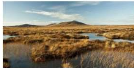
Flow Country Partnership

To celebrate the anniversary and the survival of this remarkable route, the Far North Line Community Rail Partnership, in collaboration with the Friends of the Far North Line, the Highland Railway Society and RSPB Forsinard, are staging an event at Forsinard on Friday 21 st June. Speakers will cover the history and the future prospects of both the line and the landscape. Following this a bus will take those interested to Thurso to travel the line back to Forsinard – and on to Inverness if required – on the last southbound train of the day.